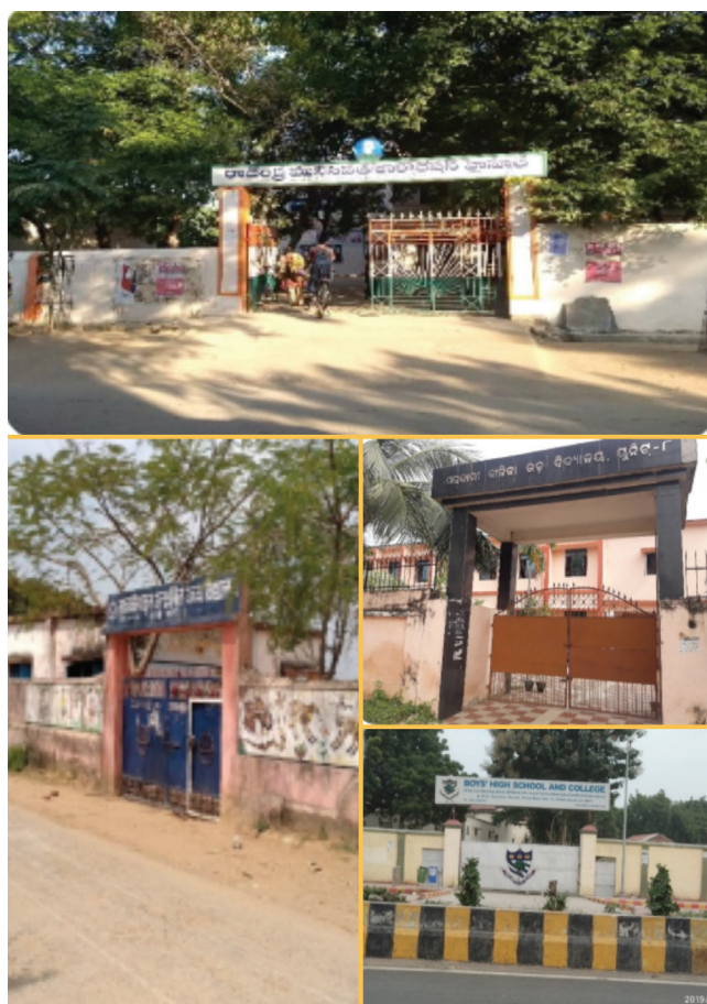
Figure 4. Illustrative photographs of violations of COTPA Section 4