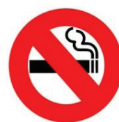
Figure 1. No-smoking signage for educational institutions as per COTPA Section 4

No Smoking Area Smoking here is an offence